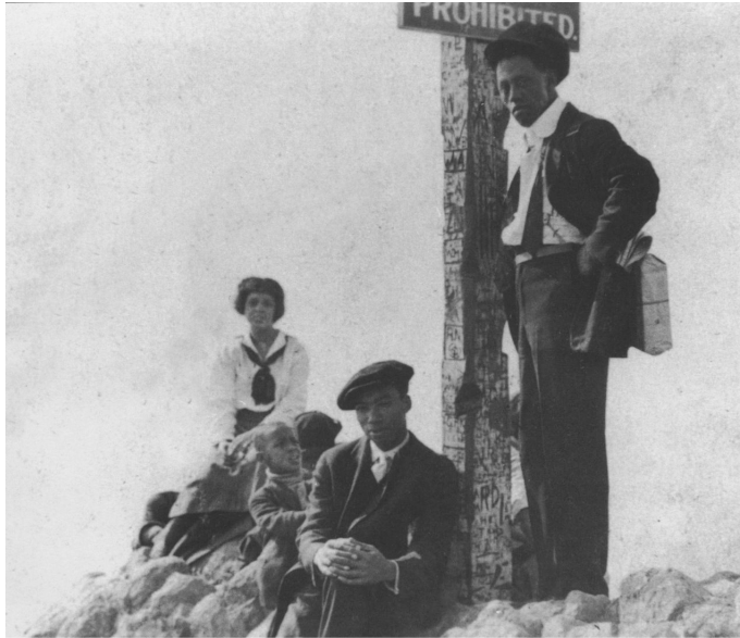
This photograph from the early 1920s shows a disappointed black family at the dividing line banning blacks from the white sections of Santa Monica Beach. 92

To cross racial lines at any beach was to court conflict, arrest, and violent assault. “They made it miserable for you. Sand would get kicked over on your place and all the rest of it.” 89 Santa Monica banned dance halls and blocked a proposed black resort near the Inkwell in the early 1920s. 90 In 1937, a man impersonating a sheriff’s deputy ordered black visitors to leave Pacific Palisades. When the black folks refused, the “officer” threatened violence but ultimately left. 91