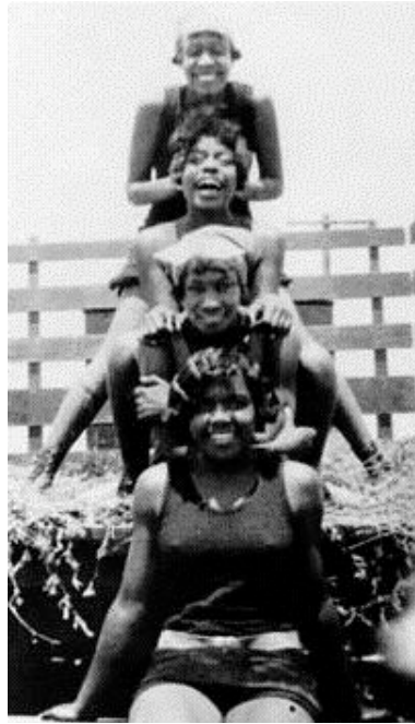
Hayride at Bruces' Beach circa 1920s. 85

As coastal land became more valuable and the black population in Los Angeles increased—bringing more African-Americans to Bruces' Beach—so did white opposition to the black beach.