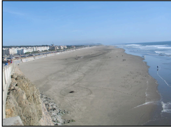
The City of San Francisco provides five miles of open access at Ocean Beach alone. 288

People should go to the beach and have fun. Every beach outing is a victory for public access. Paths to and along the beach should be clear and well marked with user-friendly signs. Beach signs should explain that the California coast belongs to all the people, with maps showing public access. Beaches should have well-maintained toilets and trash cans. There should be affordable buses or shuttles to the beach, with bus stops within a short walking distance of each access path. There should be pedestrian cross walks to and from beach access paths to get across traffic safely. There should be ample parking near the beach access paths.