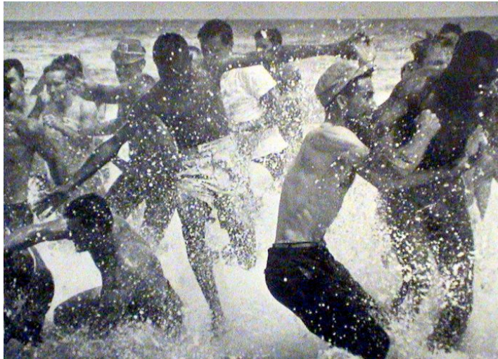
"Wade in" at a segregated beach in St. Augustine, Florida, on June 25, 1964. 209

The Southern Christian Leadership Conference (SCLC), led by Martin Luther King, Jr., conducted a "wade in" at a segregated beach in St. Augustine, Florida, on June 25, 1964. Participants were attacked. SCLC's St. Augustine campaign ended when President Lyndon Johnson signed the Civil Rights Act of 1964 in July. 208