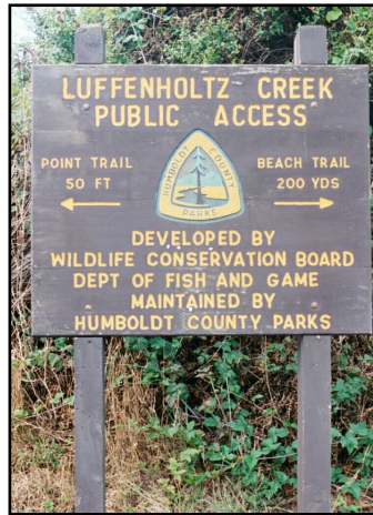
Paths to beaches should be clearly marked with inviting language. 289

People should go to the beach and have fun. Every beach outing is a victory for public access. Paths to and along the beach should be clear and well marked with user-friendly signs. Beach signs should explain that the California coast belongs to all the people, with maps showing public access. Beaches should have well-maintained toilets and trash cans. There should be affordable buses or shuttles to the beach, with bus stops within a short walking distance of each access path. There should be pedestrian cross walks to and from beach access paths to get across traffic safely. There should be ample parking near the beach access paths.