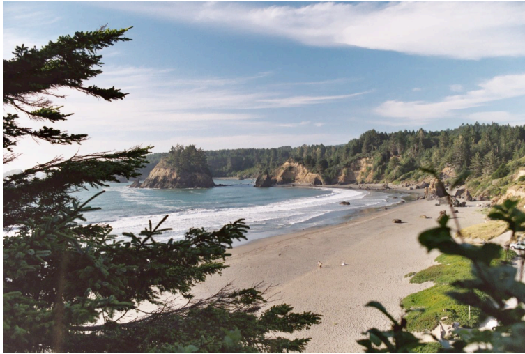
The tiny town of Trinidad was forced to consider bankruptcy to pay legal fees to fight a property owner who wants to close a public trail to the beach. 116

order to reopen the trail. Forced to defend itself against the homeowner, Trinidad—the fourth-smallest city in California—was forced to consider bankruptcy, a county takeover, or a tax increase to pay its legal bills and keep the public beach free for all. 114 Shortly before the case was due to go to trial, the Coastal Commission, City of Trinidad, and Mr. Frame reached an agreement that will preserve the public access trail. 115