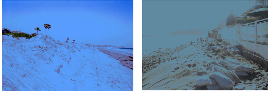
Broad Beach property owners used heavy equipment to steal sand from public land and pile it onto their property. 56

In June 2005, property owners on Broad Beach in Malibu took the astonishing step of using heavy equipment to steal sand from the public beach and pile it onto their private property. 53 The property owners' actions damaged natural resources along the beach and dramatically reduced the amount of public access. 54 During low to medium tides, some areas along Broad Beach were cut off from public access unless beach users walked on the berm or through access paths in property owners' backyards. 55