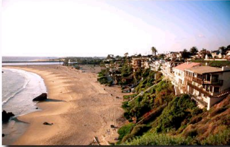
A Newport Beach councilman opposes grass at Corona del Mar State Beach because "with grass we usually get Mexicans." 108