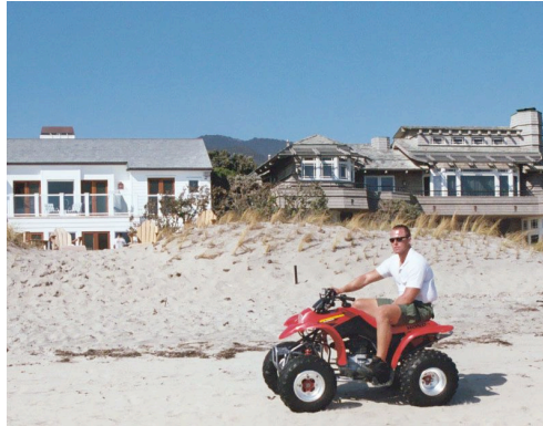
Patrolling Broad Beach on an all-terrain vehicle. 206

The Coastal Commission has ordered an end to the use of all-terrain vehicles (ATVs) by security guards who harass the public on public beaches. 204 The use of ATVs constitutes development under the Coastal Act, insofar as ATVs change the intensity of land or water use (by increasing use of the land by security guards and reducing use of beaches by the public) or causing non-agricultural removal of vegetation by treading on the vegetation. 205