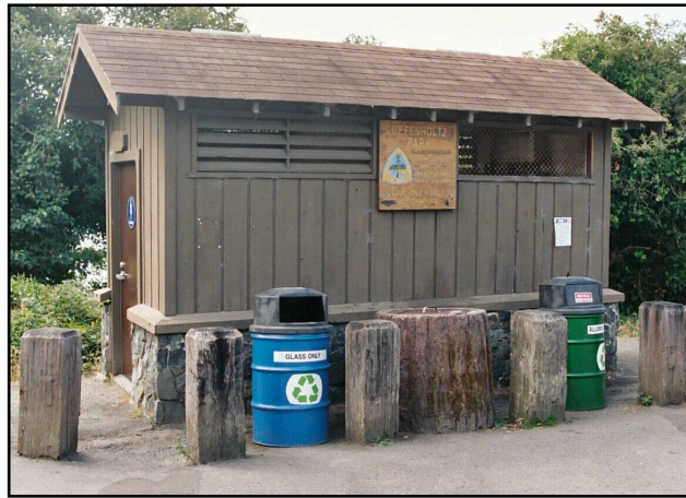
Public beaches can easily provide garbage cans, recycling bins, and toilets. 290

Appropriate signs and law enforcement must protect the right to reach the beach. Phony and misleading “no trespassing” and “private beach” signs should be banned and removed from public beaches. Private security guards should be prohibited from harassing the public on public beaches. All-terrain vehicles should be prohibited on public beaches. Local law enforcement agencies should zealously enforce the public’s right to use the beach, rather than harass people. Law enforcement officials including sheriff’s deputies should be educated about the public’s right of access to the beach.