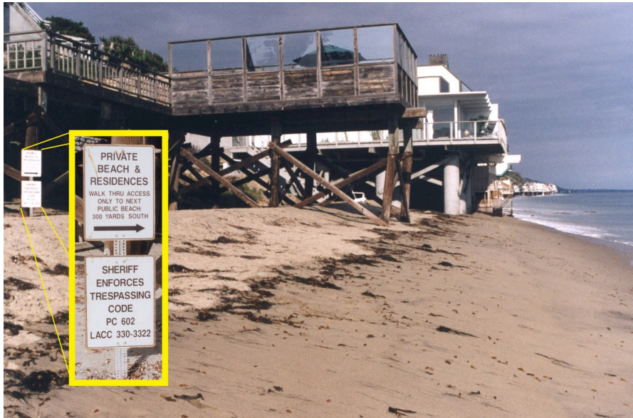
Sign on Broad Beach in Malibu reads "Private Beach & Residences: Walk Thru Access Only to Next Public Beach 300 Yards South." 80

In seeking to prevent the public from using the beach, Malibu cites concerns about traffic congestion, parking, trash, and security. But just about every Los Angeles neighborhood today faces congestion, parking, sanitation, and personal security concerns, without cutting off public access to parks, streets, trails, and other public goods. Malibu residents can too. If Malibu residents do not like the public on the public beach, there is a simple solution: move.