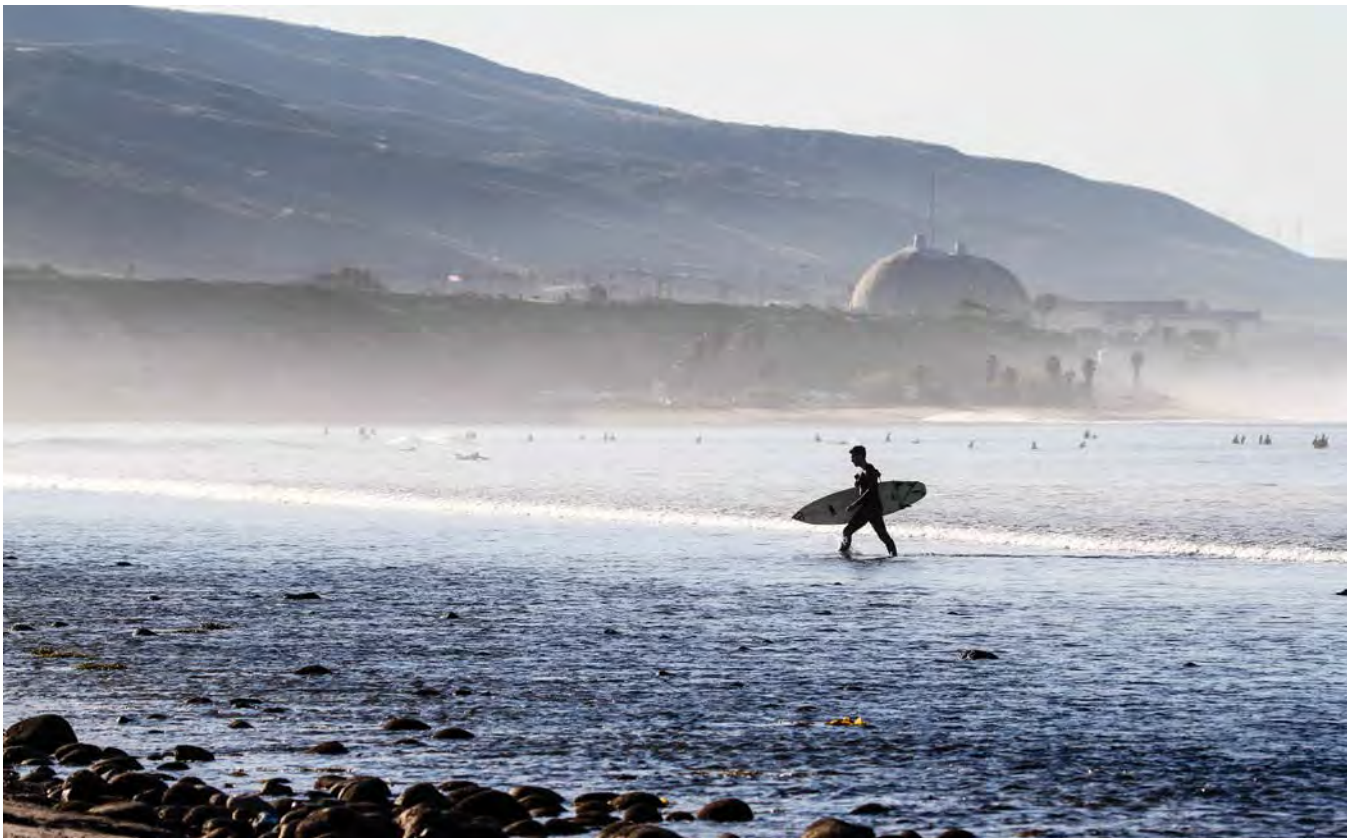
Surfer, Trestles.