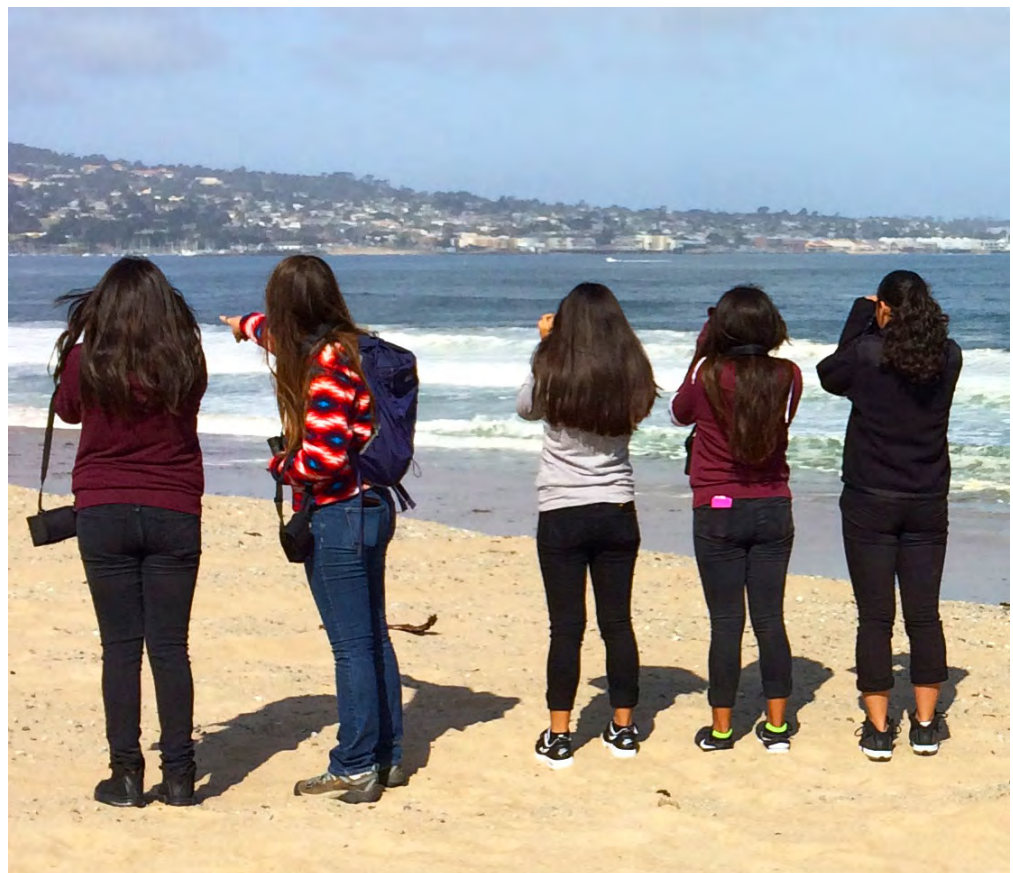
Students in Seaside.

Students transition to individual journaling and complete a Reflective Summary in their notebooks that responds to the Guiding Questions of the day by making thinking visual. Teacher should encourage students to respond with a cartoon, concept map, or diagram, in addition to any prose they may deploy. Teacher guides, prompts, and evaluates student thinking.