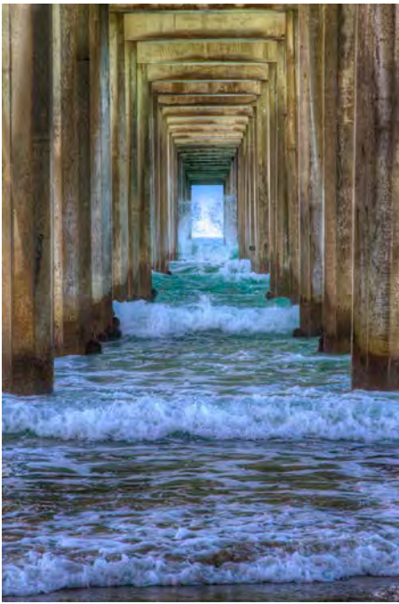
Scripps Pier.