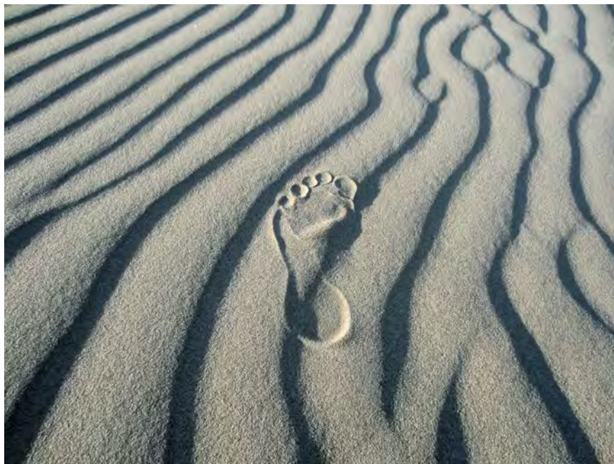
Footprint in Oceano.