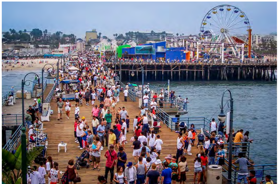
Santa Monica.

Read "Contesting the Coast" roles to prepare for mock California Coastal Commission meeting.