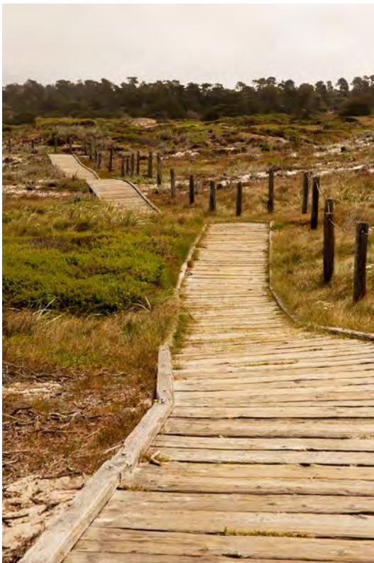
Pacific Grove.

Spurred by Sea Ranch and other issues impacting the coast, the Sonoma County activists joined other organizations and individuals to bring a statewide initiative to the voters to create a California Coastal Commission, which would be responsible for regulating coastal development and protecting coastal access in California.