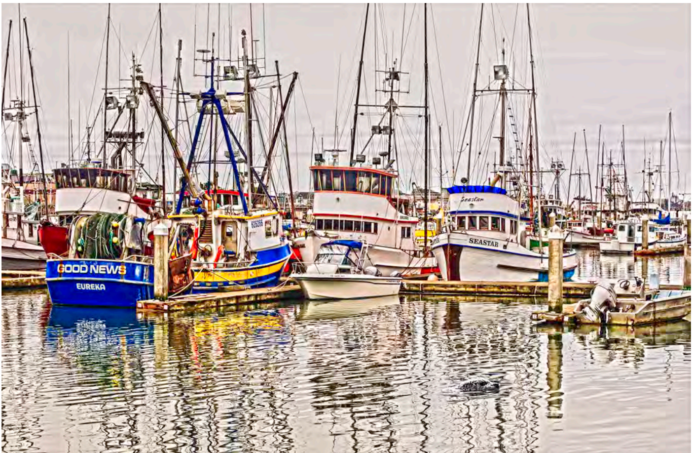
Eureka Harbor.

These meetings are public and your class is welcome to attend and submit comments, respecting the rules and procedure of the meeting. The monthly Coastal Commission meetings are also streamed live online and previous meeting videos are archived. Check the website for links.