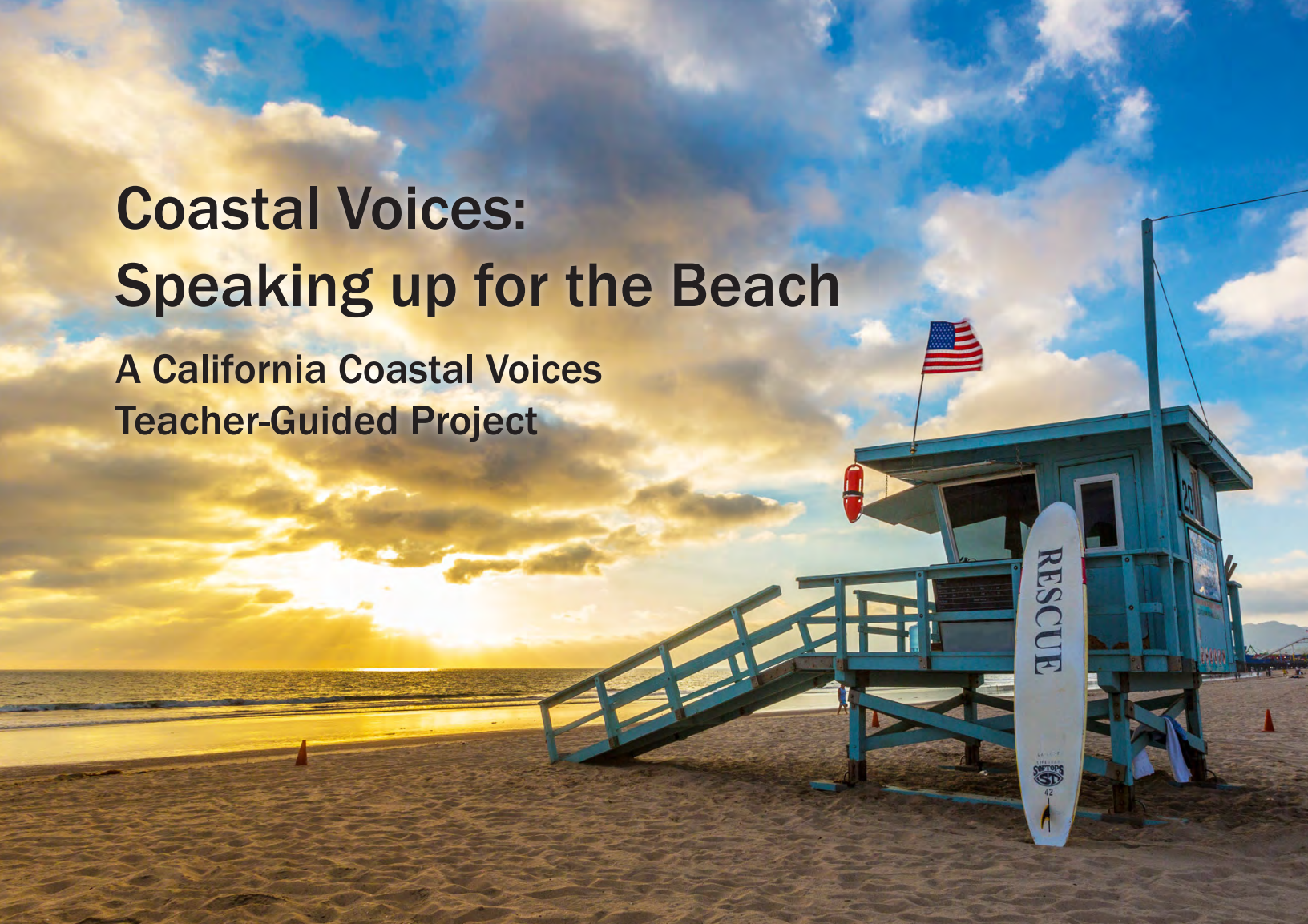
Santa Monica Beach.

A California Coastal Voices Teacher-Guided Project