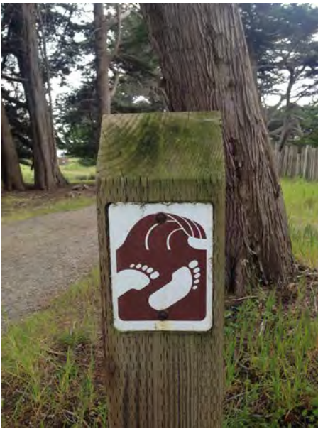
Beach access sign in Sea Ranch