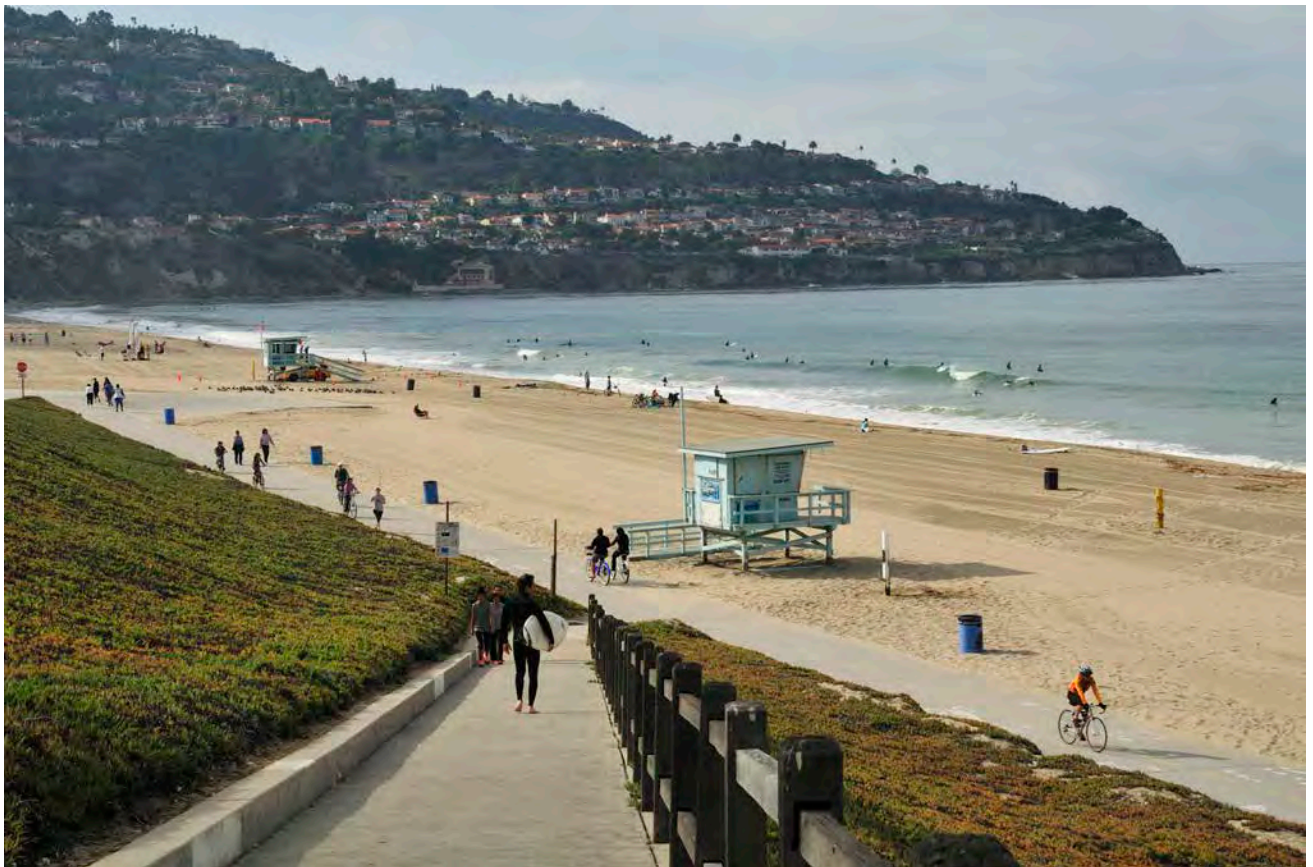
Torrance County Beach.

Students transition to individual journaling and complete a Reflective Summary that responds to the Guiding Questions. Students respond with a cartoon or diagram, in addition to any prose they may deploy. Teacher guides, prompts, and evaluates student thinking.