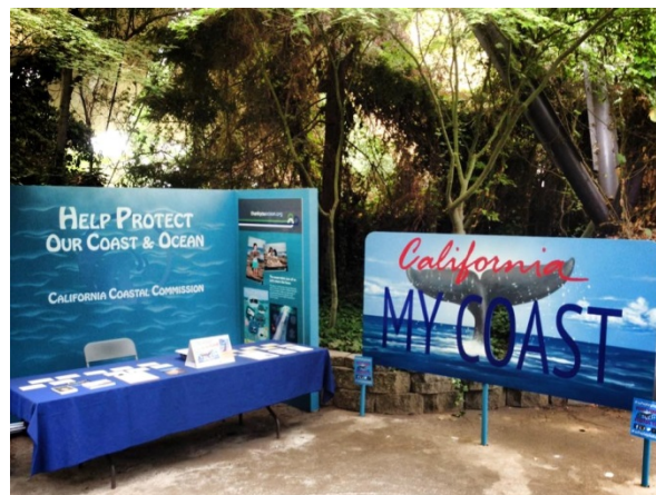
CCC Booth at California State Fair in Sacramento

Each year, staff attends a number of environmental fairs and events, where we have an educational booth, hand out materials, and talk to attendees. This year we exhibited our education resources and spoke to 2,125 people at 13 events. Our 2014 list of events included Saint Ignatius Enrichment Fair, Monterey Whale Fest, Mendocino Whale Fests, San Jose State Earth Day, Los Angeles Sanitation Districts Earth Day, Earth Day at Drake High School in San Anselmo, Pacifica Earth Day of Action, San Diego County Fair in Del Mar, California State Fair in Sacramento, State Scientists Day in Sacramento, Beneath the Waves Film Festival in Santa Cruz, Olompali Heritage Day in Marin County, and the Friends of San Leandro Creek Environmental Forum.